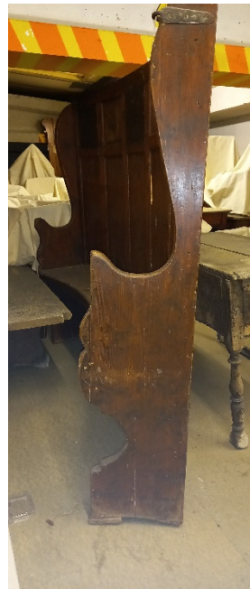
Wood settle side view