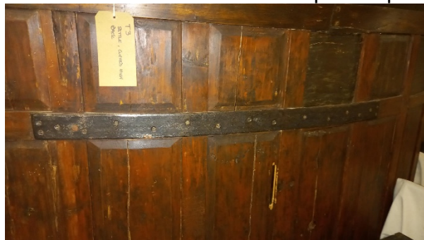
Settle back detail.