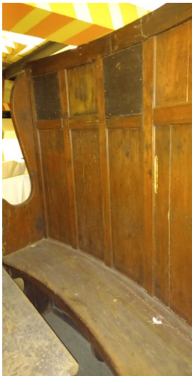
Settle back view of replaced panels